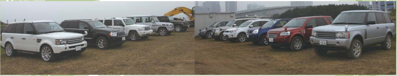
The show offers a wide range of off-road vehicles to experience, extending from 660 cc all the way through 5,000 cc