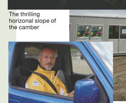
Professional drivers show off their technique

Descending a slope of up to 40 degrees feels almost like falling