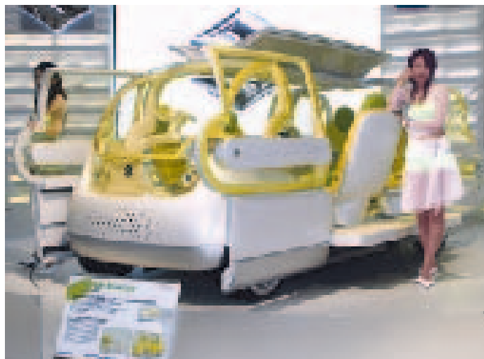
"Mobile Terrace" shows the future of fuel cell vehicles.

The stage near the central aisle displays two very cute vehicles, the "S-RIDE" and the "LANDBREEZE." The "S-RIDE" combines motorcycle-like driving enjoyment with the practicality of an automobile. Suzuki bills it as an "urban commuter," giving it two seats, front and back, in a minicar size that is perfect for urban transportation. The "Landbreeze" is a compact SUV built with environment-friendly materials such as easily-recycled aluminum and tires made entirely of natural resources not based on petro-