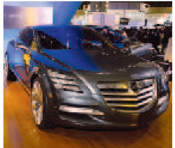
"Insignia" is a new style of luxury sedan.

Also in the Opel corner is the third generation of "Astra." While looking backwards towards traditional hatchbacks, the new version has Opel's trademark "V-shaped radiator grill," and has an interactive driving system on board to give it a sportier flavor.