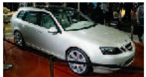
The "9-3 Sports-Hatch Concept" is a multifunction wagon.

"Contemporary Scandinavian" is the concept underlying the three sedately elegant Saab models on display. The "9-3 Sports-Hatch Concept" heads the list, followed by the "9-3 Convertible Aero" and the "9-5 Estate Aero." While keeping the traditional five-door Saab design, the "9-3 Sports-Hatch Concept" is an ambitious midsized wagon that clearly has market launch in mind. The 2.0 liter turbocharged engine has a maximum 250 horsepower, enough to satisfy the most active drivers. It also uses Saab's proprietary multilink rear suspension that comes with a "ReAxs" passive rear-wheel steering system to increase cornering per-