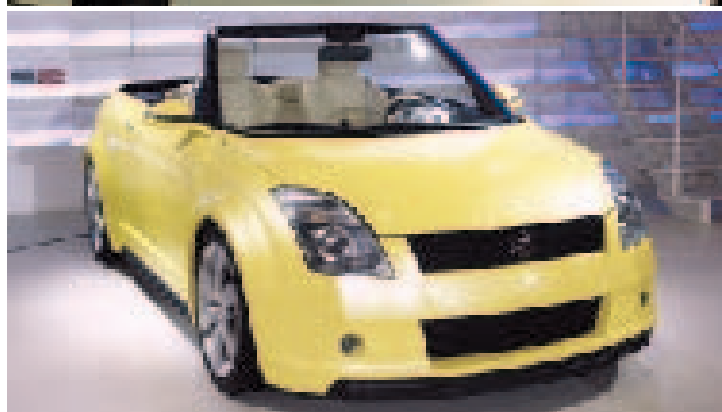
The "Concept-S2" seats four comfortably in spite of its compact size.