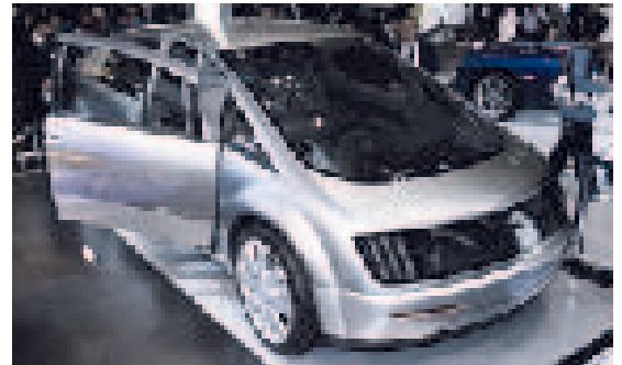
"Hy-Wire" uses fuel cell and "By-wire" technology.

Chevrolet features the "Epica," which was designed by Giorgetto Giugiaro and the famed Ital design team in Italy. The brand also displays the "Optra," a Pininfarina design that is scheduled to be launched on the Japanese market. Hummer gives visitors the chance to see its "Hummer H2" off-road vehicle up close, proudly displaying its full impact.