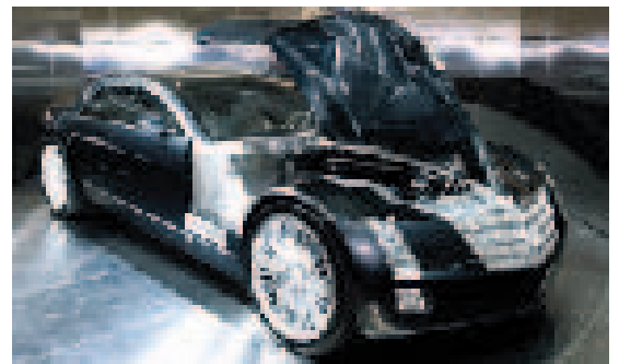
"Sixteen" has a gullwing bonnet.