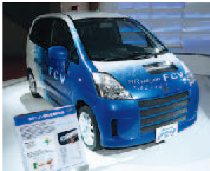
"MR wagon FCV" brings fuel cell technology to minicars.

leum Popular with the ladies is the fashionable "Twin My Style," a one-seater based on the "Twin" minicar. The "Mobile Terrace" represents the future of Suzuki fuel cell vehicles, packing a generous three rows of seats into a compact, four-meter body. Suzuki also shows its minicar-sized fuel cell vehicle, which it developed in collaboration with partner GM. The car is notable for the compactness it has achieved in the fuel cell unit.