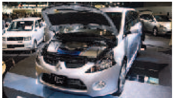
Fuel cell vehicle (FCV) with DaimlerChrysler fuel cell system.