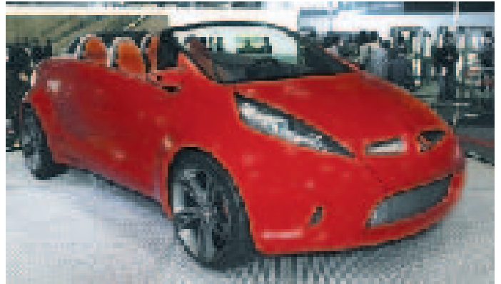
The "Tarmac Spyder," a high-performance sports model.