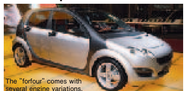
The "forfour" comes with several engine variations.

The "forfour" is a 3,752 mm long compact car that shares a platform with the Mitsubishi "Colt." DaimlerChrysler and Mitsubishi are partners. With five doors and four seats, the car offers sporty driving with a distinctive "smart" styling. The coloring for this fashionable compact is based on smart's two-tone identity coloring scheme.