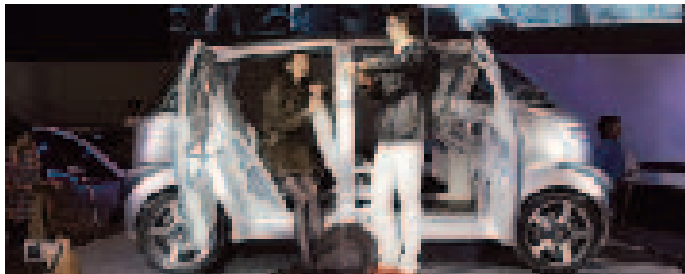
The "i" small car (top) and the aluminum-bodied, retro-flavored "SE-RO" (bottom).