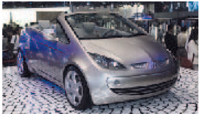
The "CZ2 cabriolet" is targeted at females.