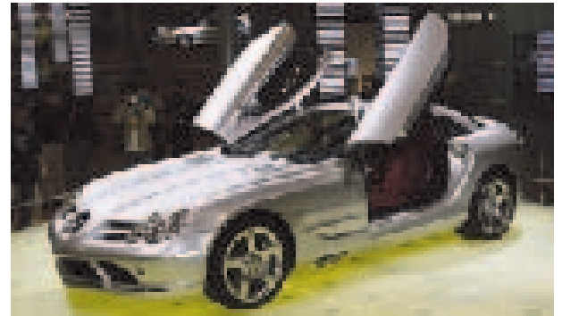
The "SLR McLaren" is built with F-1 technology.

What garners the most attention, however, is the "SLR McLaren." Based on the "Vision SLR" shown at the 33rd Tokyo Motor Show, this is a 21st century sports car with an infusion of McLaren racing technology. The V8 engine features a newly developed supercharger and offers an incredible 626 horsepower, placing it squarely at the peak of Mercedes-Benz sports cars.