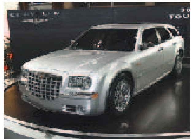
The "Chrysler 300 C Touring" updates the traditional American car image.

The "Chrysler Crossfire" is making its first appearance in Japan. Originally a concept car, this two-seater specialty coupe has been promoted to a market model. Jeep's "Treo" concept car was clearly designed with young, entry-level buyers in mind.