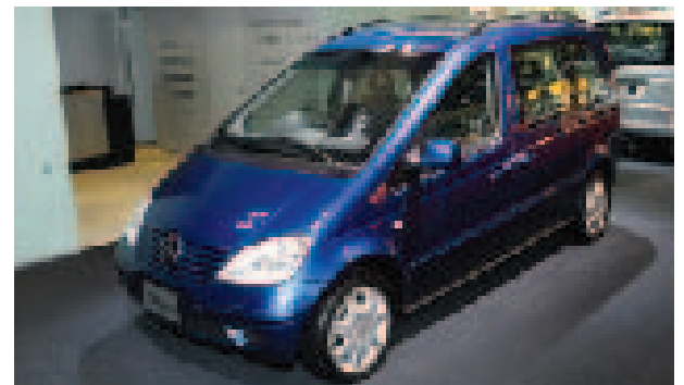
"Vaneo" offers a roomy interior in a compact size.