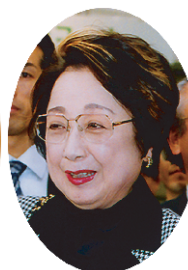
Minister of Land, Infrastructure and Transport Ogi