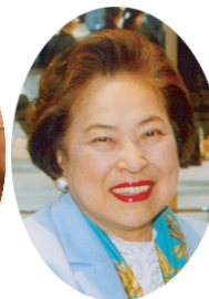
Chiba Governor Domoto