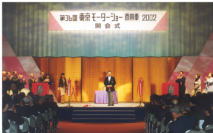
His Imperial Highness Prince Tomohito of Mikasa cuts the ribbon at the Opening Ceremony.