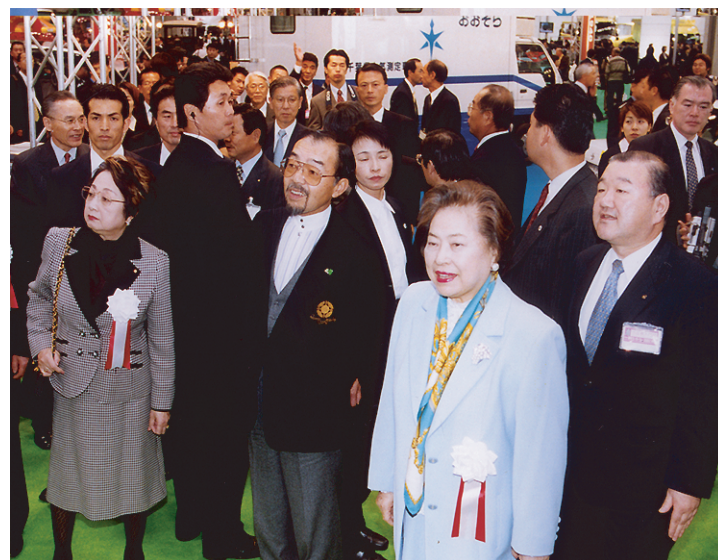
The Prince views the show with interest.